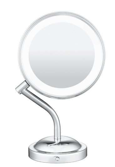
Use and Care Guide For your safety and continued enjoyment of this product, always read the instruction book carefully before using.